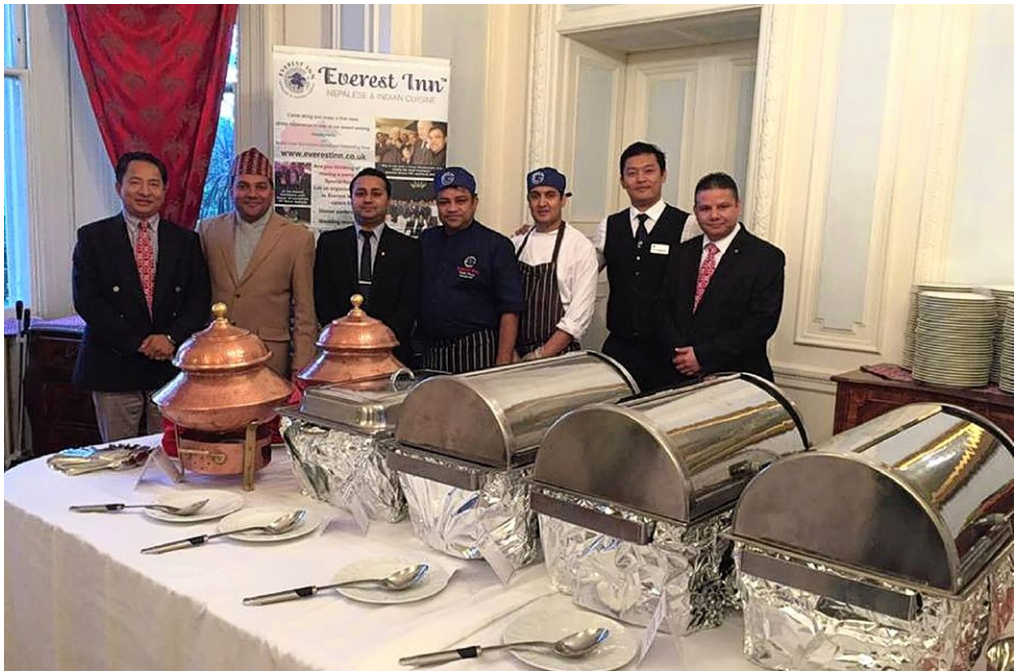
HIGH STANDARDS: The staff at Everest Inn

Favoured dishes such as Chilli Chicken with its balanced spices and herbs, a great way to start your dining experience. There are also some Nepalese dishes such as Machha Modi Khola which is a marinated white fish cooked with special Nepalese spices and fresh herbs and a touch of yogurt, a superb authentic Nepalese dish.