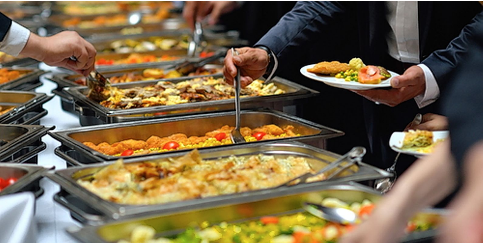
DIG IN: The buffet at Suna

For the best coffees, teas and wholesome lunches give us a call on 01303 256020. Delivery service available and our takeaway menu is available on our website: www.sunarestaurant.com .