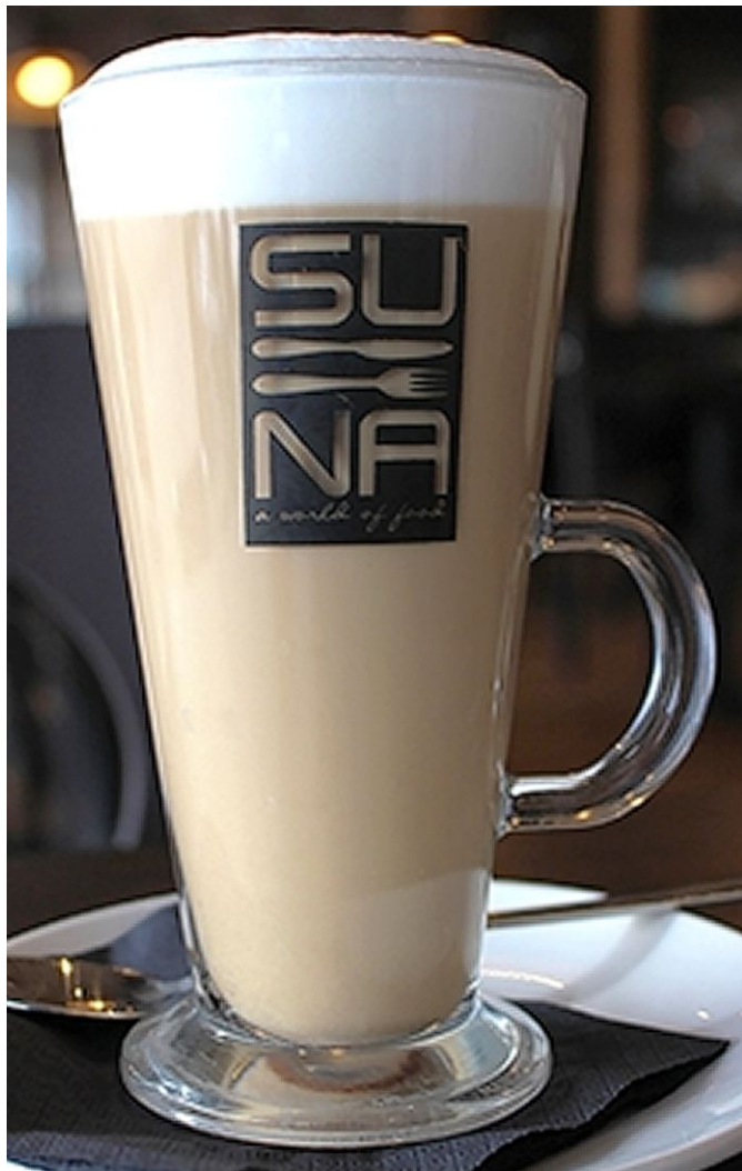
FROTHY COFFEE: Enjoy a drink at Suna

For Ashford call 01233 643643 or www.everestinnashford.co.uk and Hythe contact 01303 269898 or www.everestinnhythe.co.uk