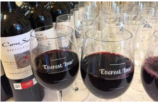
BOTTOMS UP: Wine at the diner

Serving the highest standard of cuisine with authentic flavours of Nepal and India. The chefs are highly trained and qualified to create great Nepalese food and authentic Indian food.