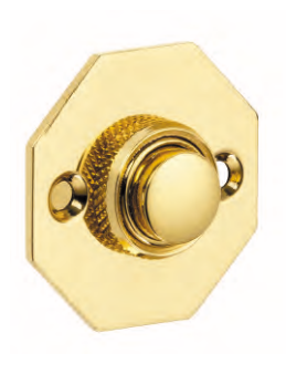
1916 Octagonal Bell Push