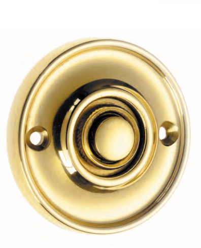
1913 Round Bell Push