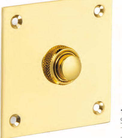
1911 Square Bell Push