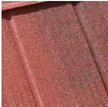
Antique Red Tile

Lighter than traditional roofing materials, quicker to fit and extremely low maintenance, this option really is ideal for conservatories, orangeries, porches and extensions alike. A colour range that boasts ebony, red, umber, green and charcoal will enable you to create the external look that you desire from your new or refurbished roof - shown on the right.