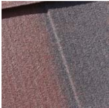
Burnt Umber Tile