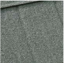
Moss Green Tile