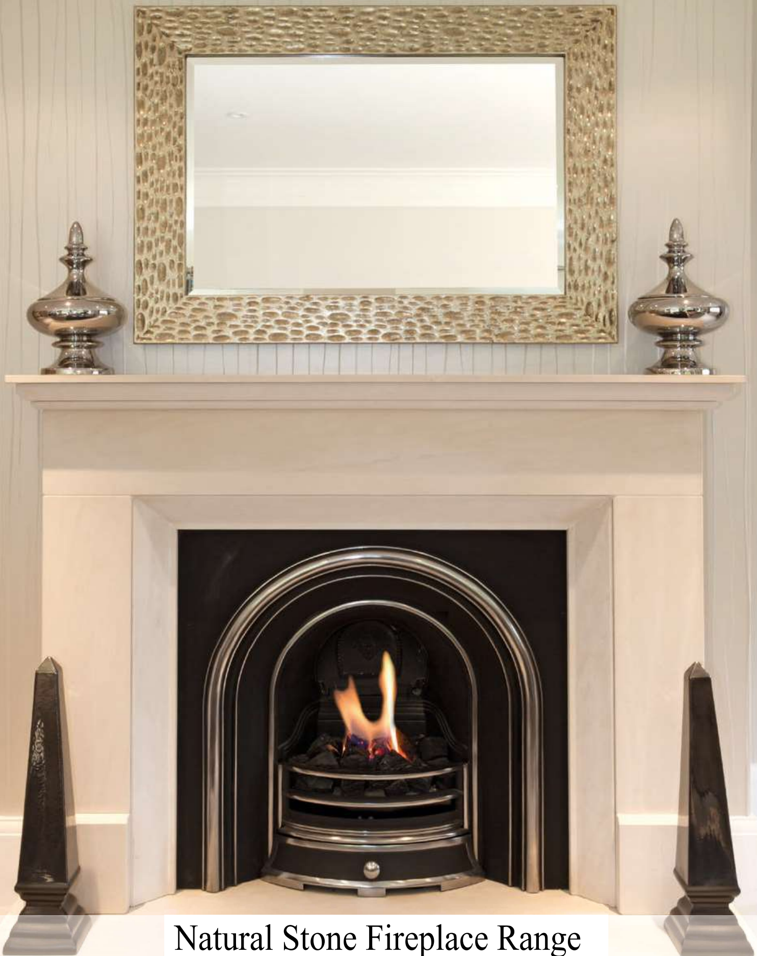
Natural Stone Fireplace Range