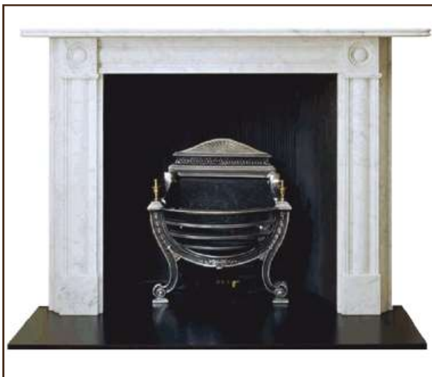
Regency Bullseye Demi

Shelf 1473mm x 228mm Overall height 1123mm Width across base 1318mm Internal opening 890mm wide x 915mm high Rebate 40mm