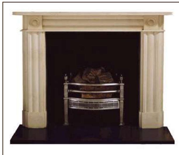
Regency Bullseye Quadrant

Shelf 1473mm x 228mm Overall height 1080mm Width across base 1320mm Internal opening 890mm wide x 915mm high Rebate 63mm