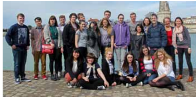
Annual French Exchange to La Rochelle