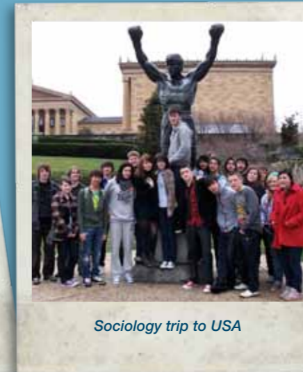
Sociology trip to USA