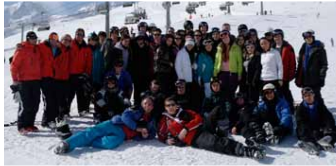
Ski trip to Austria