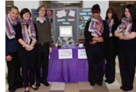
'Young Enterprise' teams: (L) Simplistix, (R) Carmel Diamonds