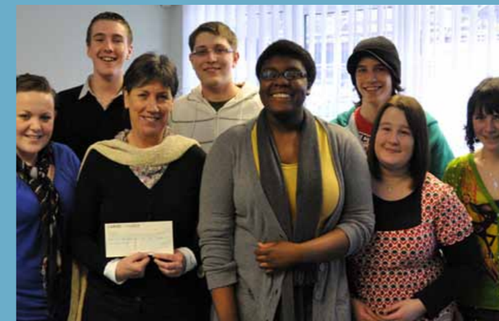
Justice and Peace Group raise money for CAFOD