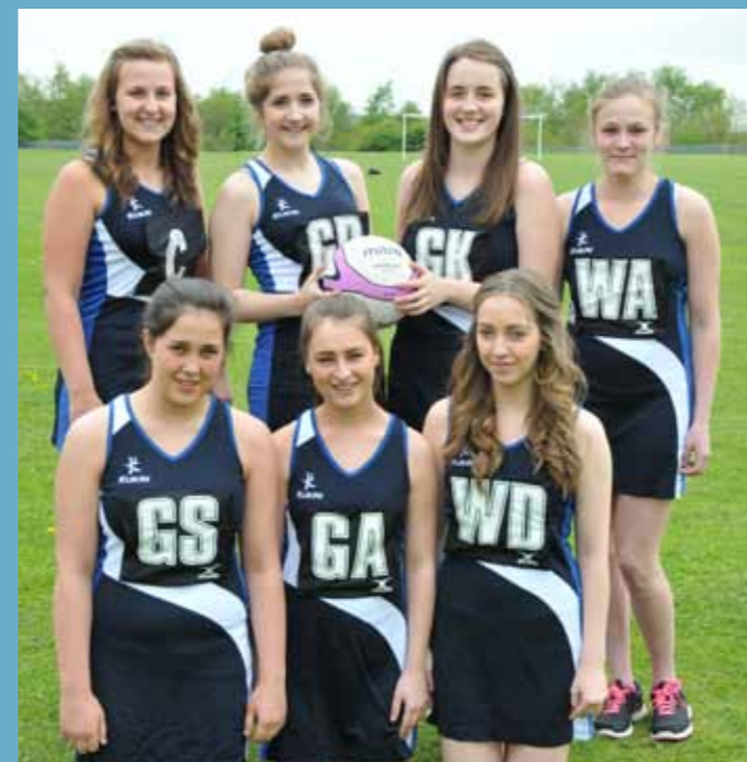
Carmel Netball Team