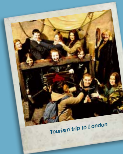
Tourism trip to London