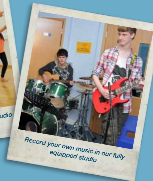
Record your own music in our fully equipped studio