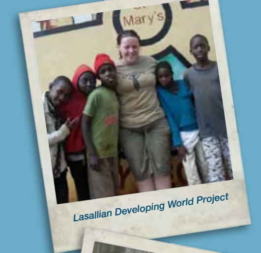
Lasallian Developing World Project