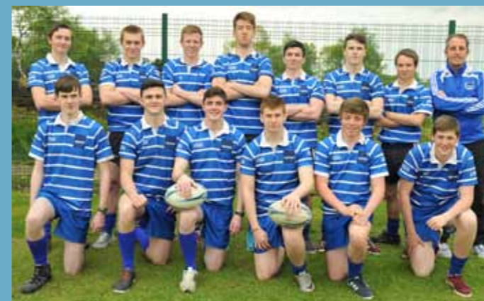
Carmel Rugby Team