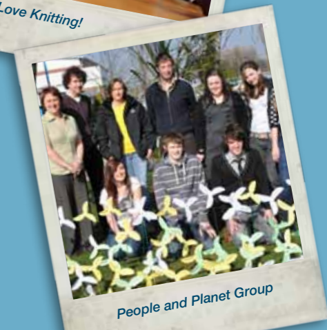
People and Planet Group