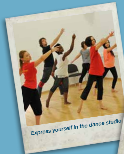
Express yourself in the dance studio