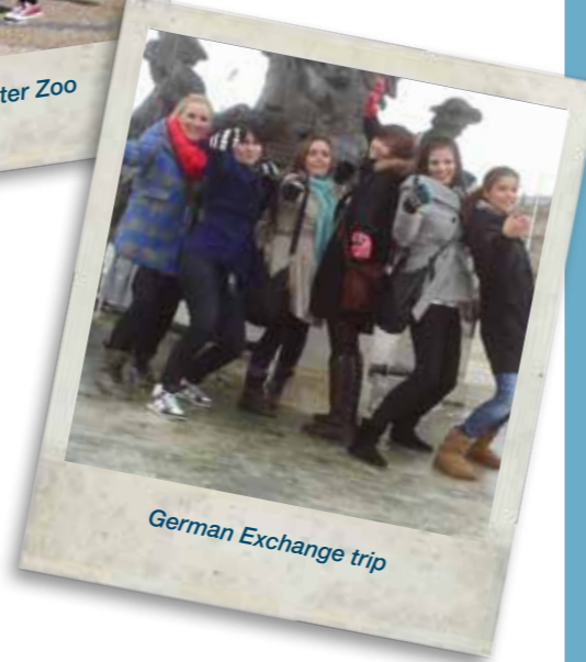
German Exchange trip