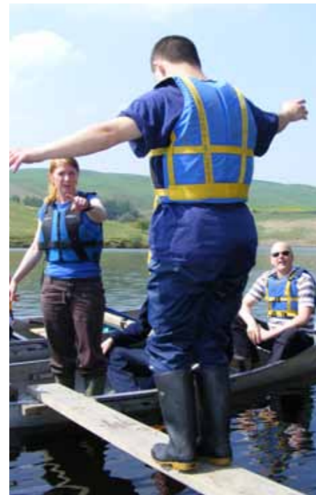
Duke of Edinburgh Above: Bronze Award Residential Right: Gold Award Expedition 2012

10 REASONS to take part in enrichment and extra-curricular activities: