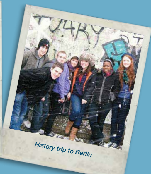
History trip to Berlin