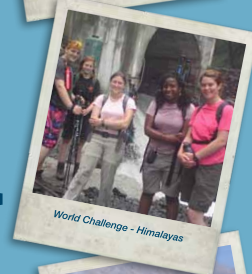
World Challenge - Himalayas