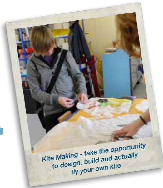
Kite Making - take the opportunity to design, build and actually fly your own kite