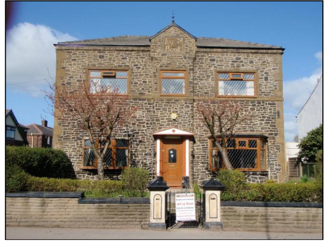
Before and After the style chosen by the client to give a local stone look. Old stone + lime pointing. Random