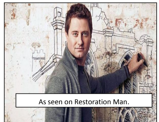
As seen on Restoration Man.