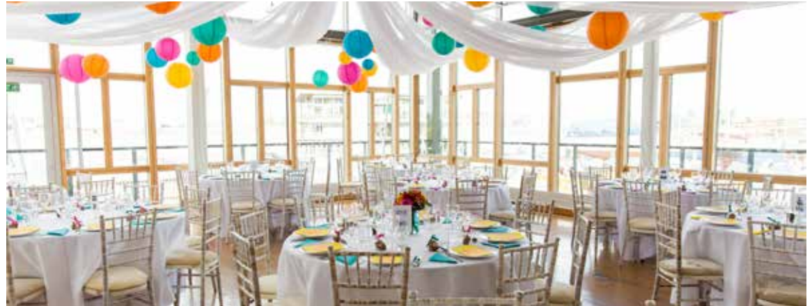
THE MAIN HALL