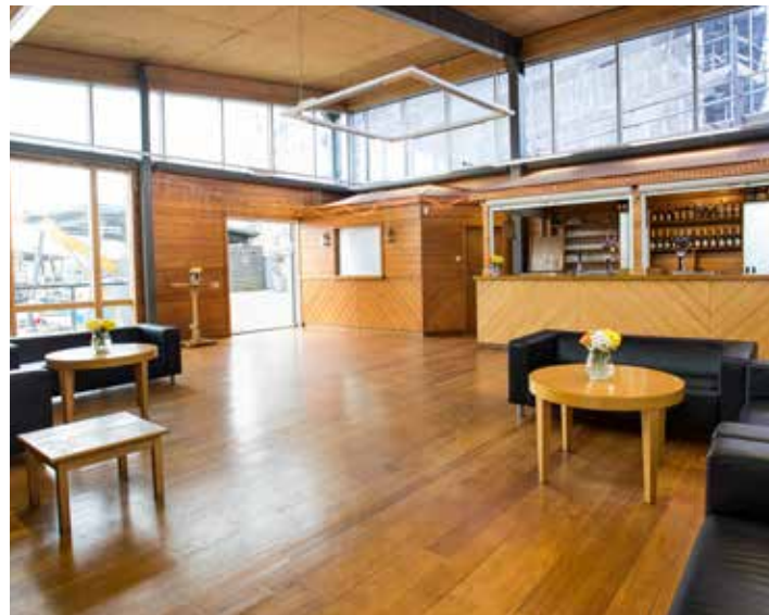
THE RECEPTION BAR