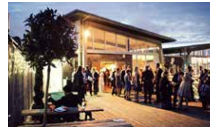
THE OUTDOOR DECKING