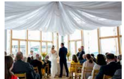
THE MAIN HALL AS CEREMONY ROOM