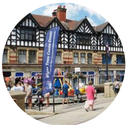
Gary Pearce @tvaerialswigan

Welcome to TV aerials Wigan, If you have TV Aerial problems or need a satellite installation inquiries regarding a SkyQ, Freeview, Freesat or HD multi-room system, call our experienced team for polite and friendly advice today.