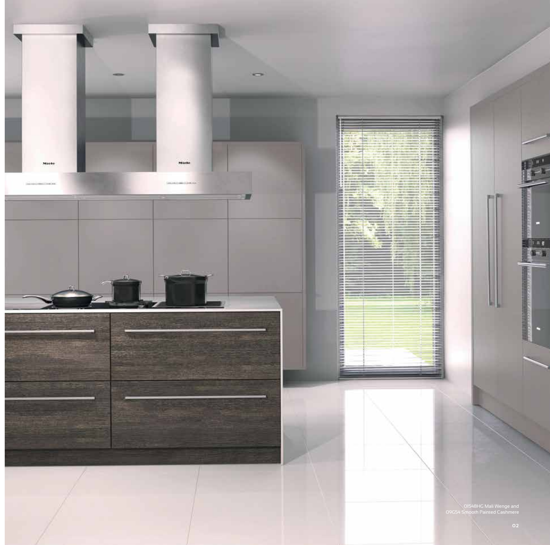
01548HG Mali Wenge and 09G54 Smooth Painted Cashmere