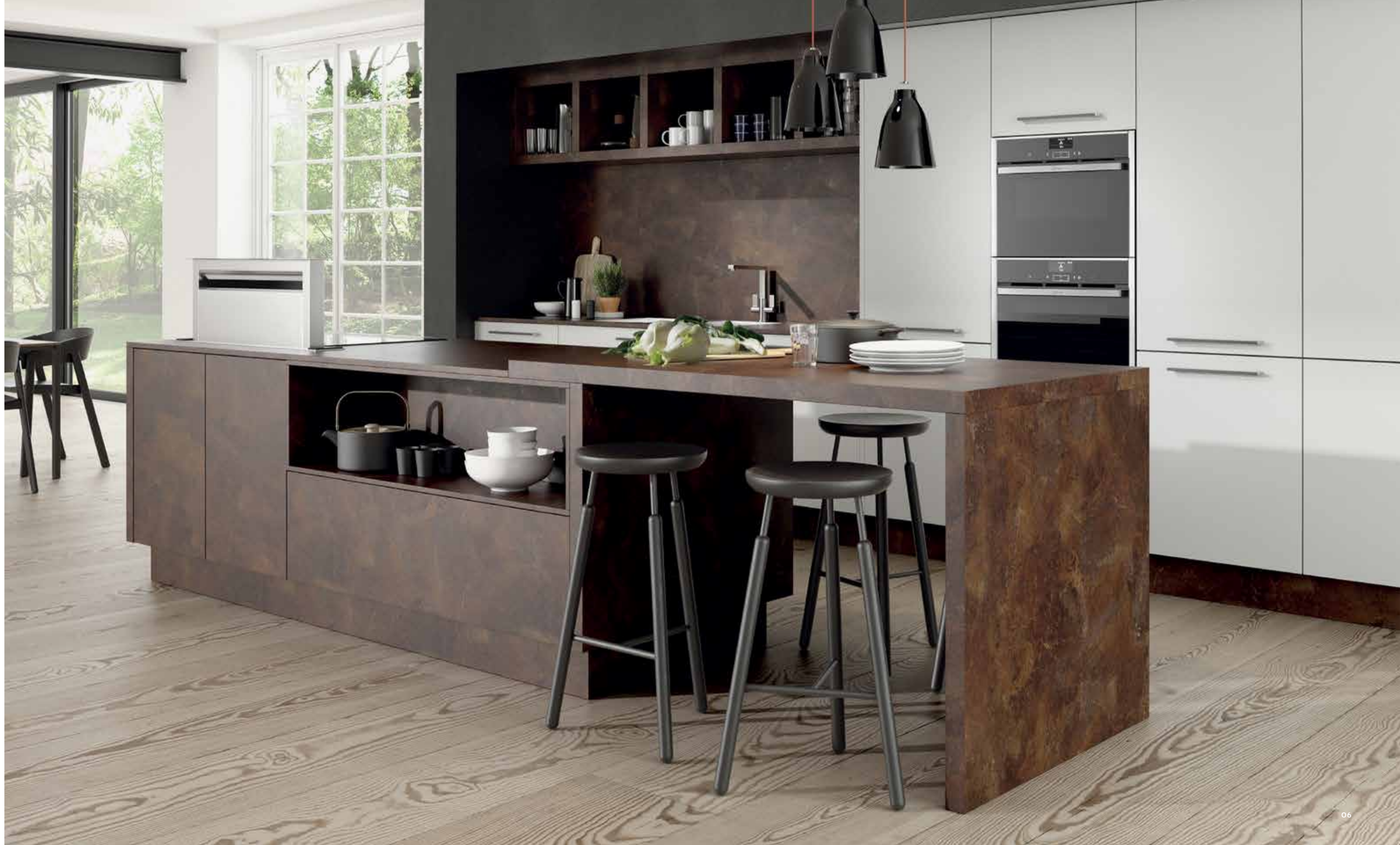
07184HG Rust Ceramic and 07253 Perfect Matt Light Grey