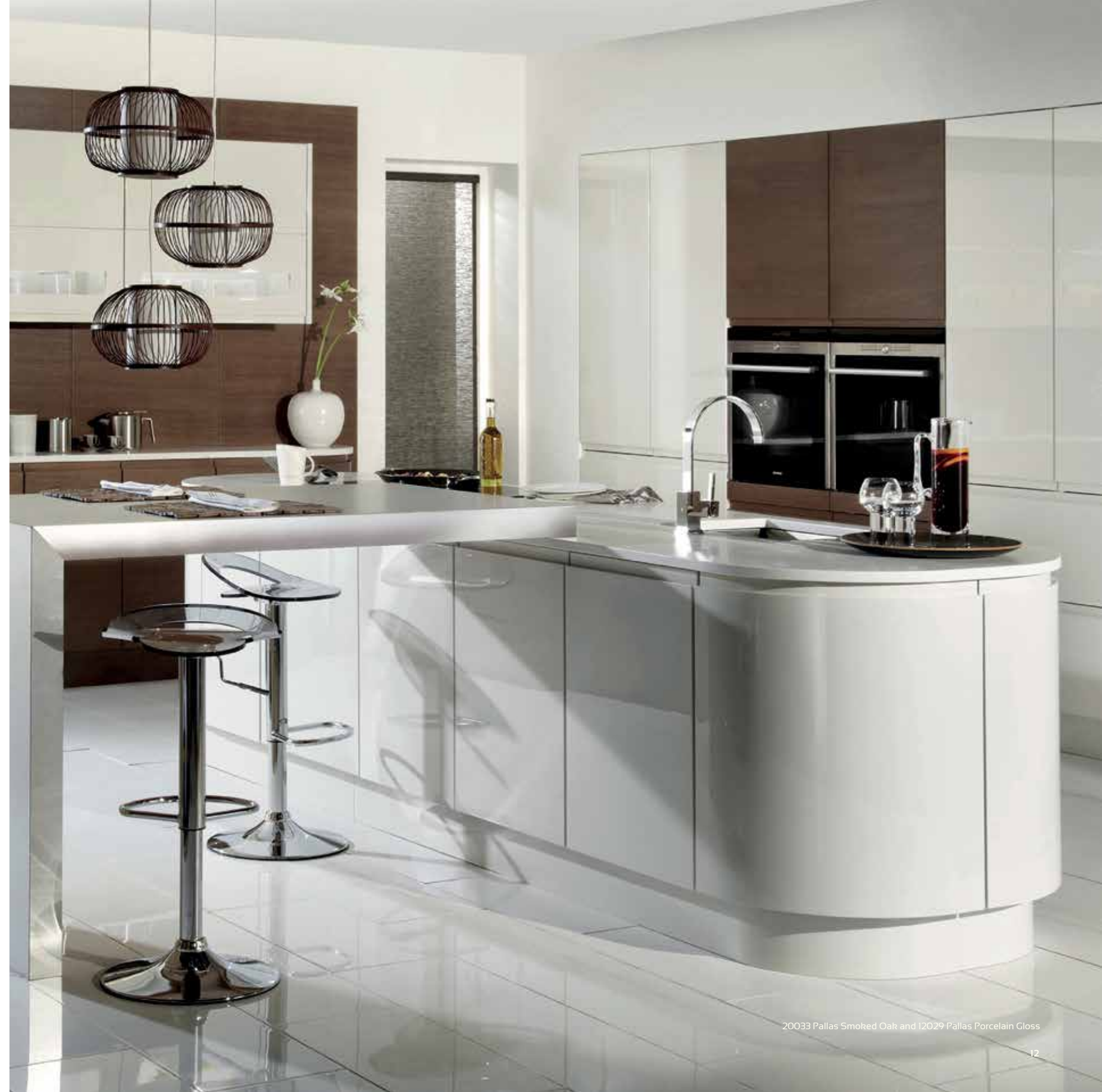
20033 Pallas Smoked Oak and I2029 Pallas Porcelain Gloss