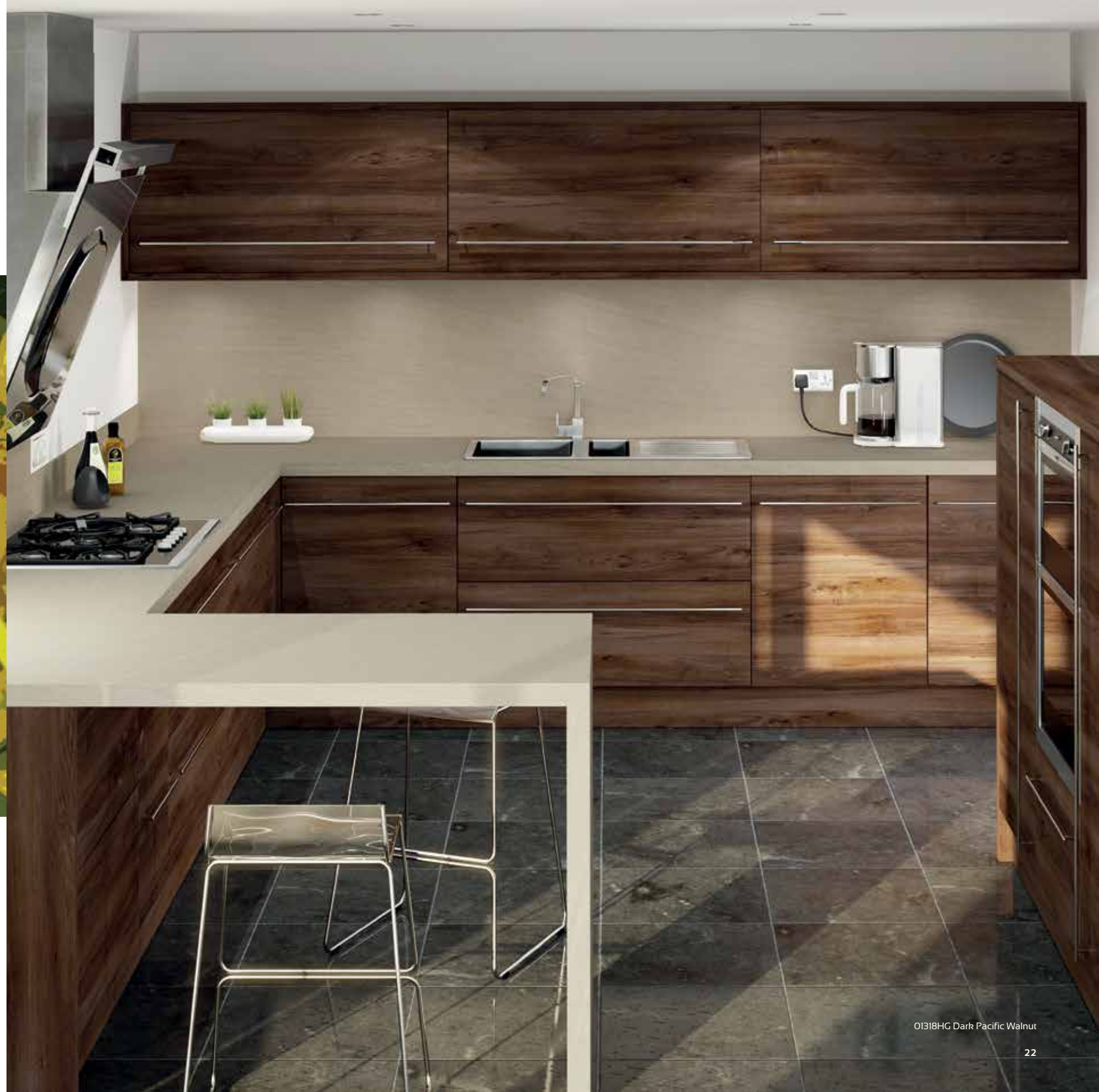
01318HG Dark Pacific Walnut