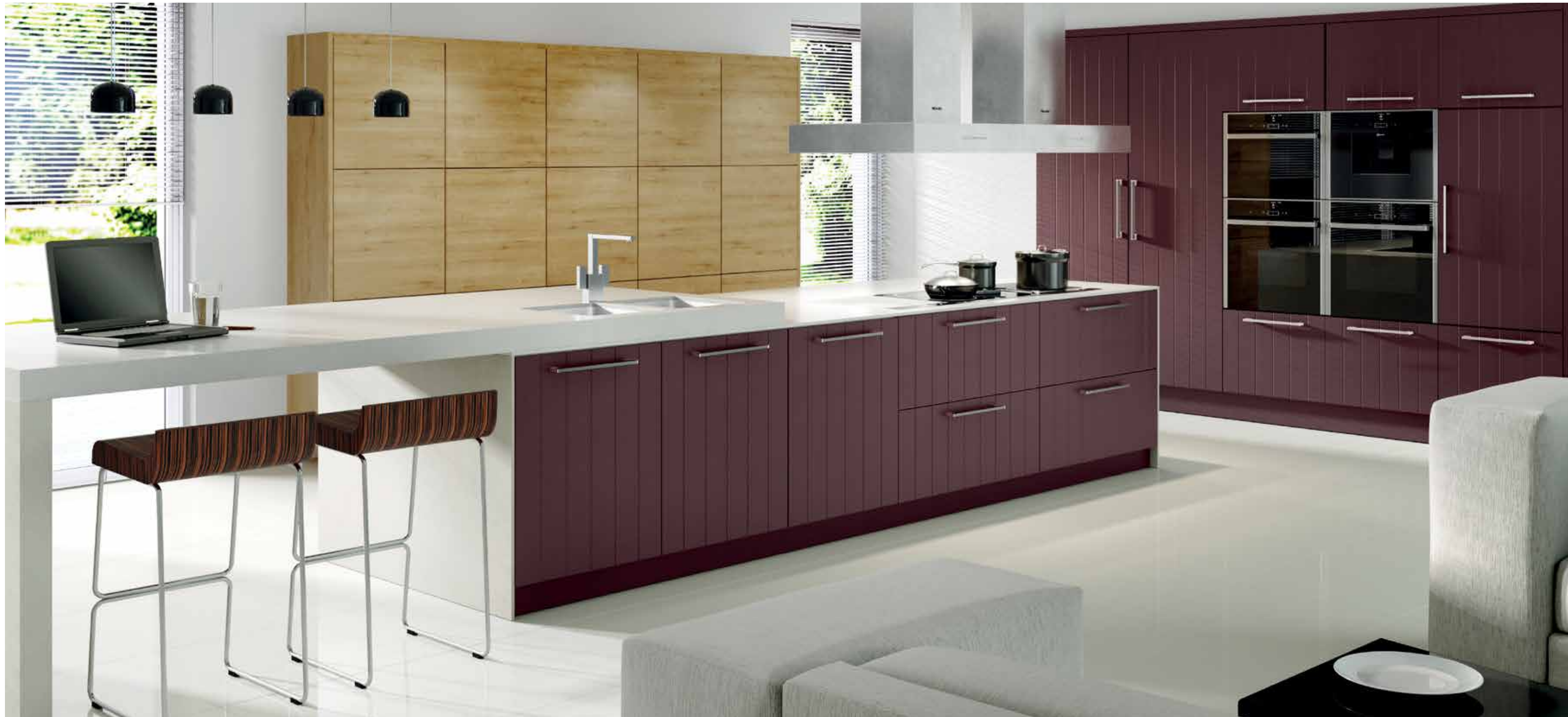
15B14 Vertical Lined Smooth Painted Wild Orchid and 01316HG Arlington Oak