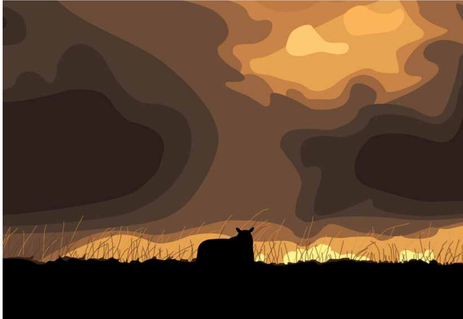
Sheep at Dusk