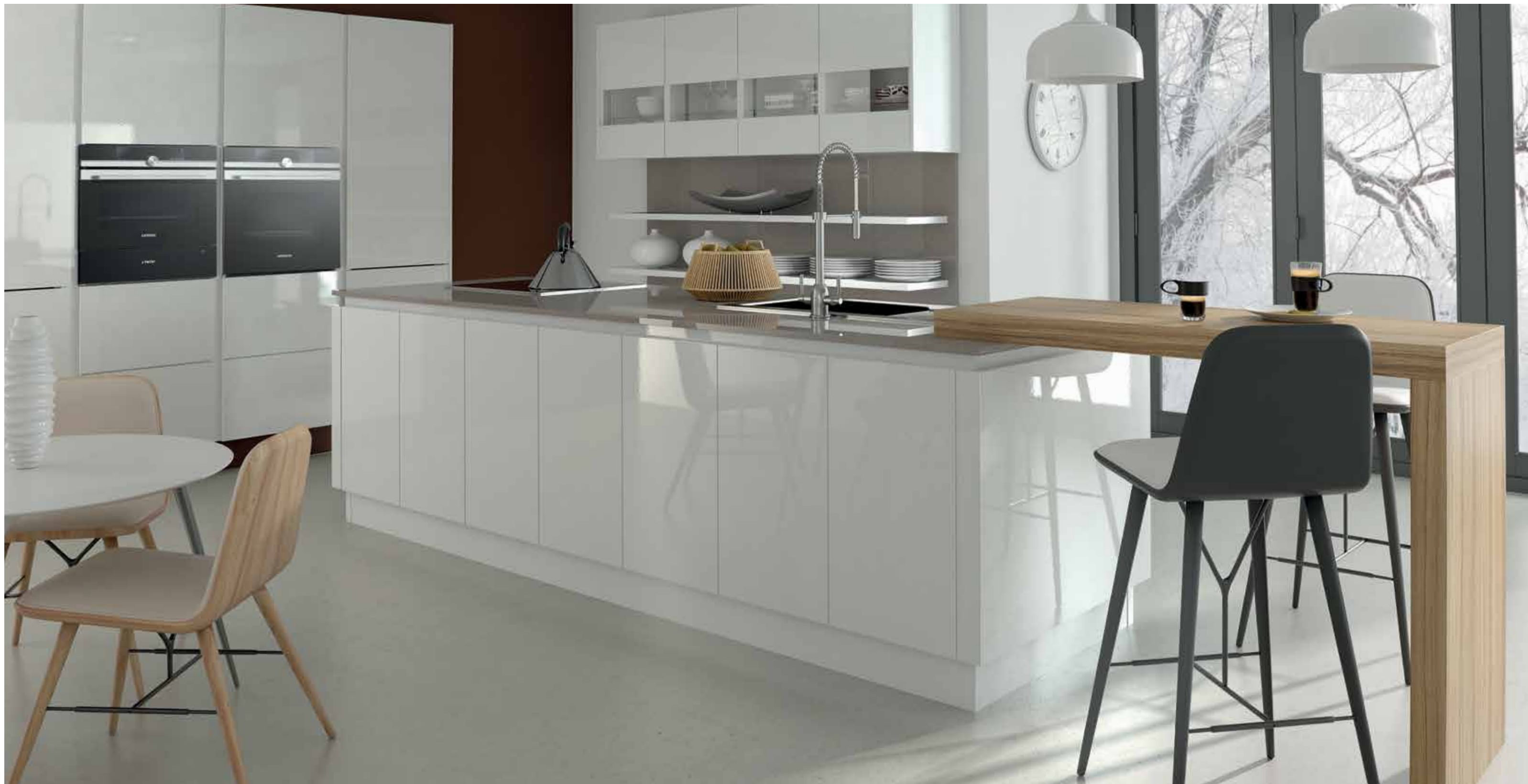
07260 Mirror Gloss White