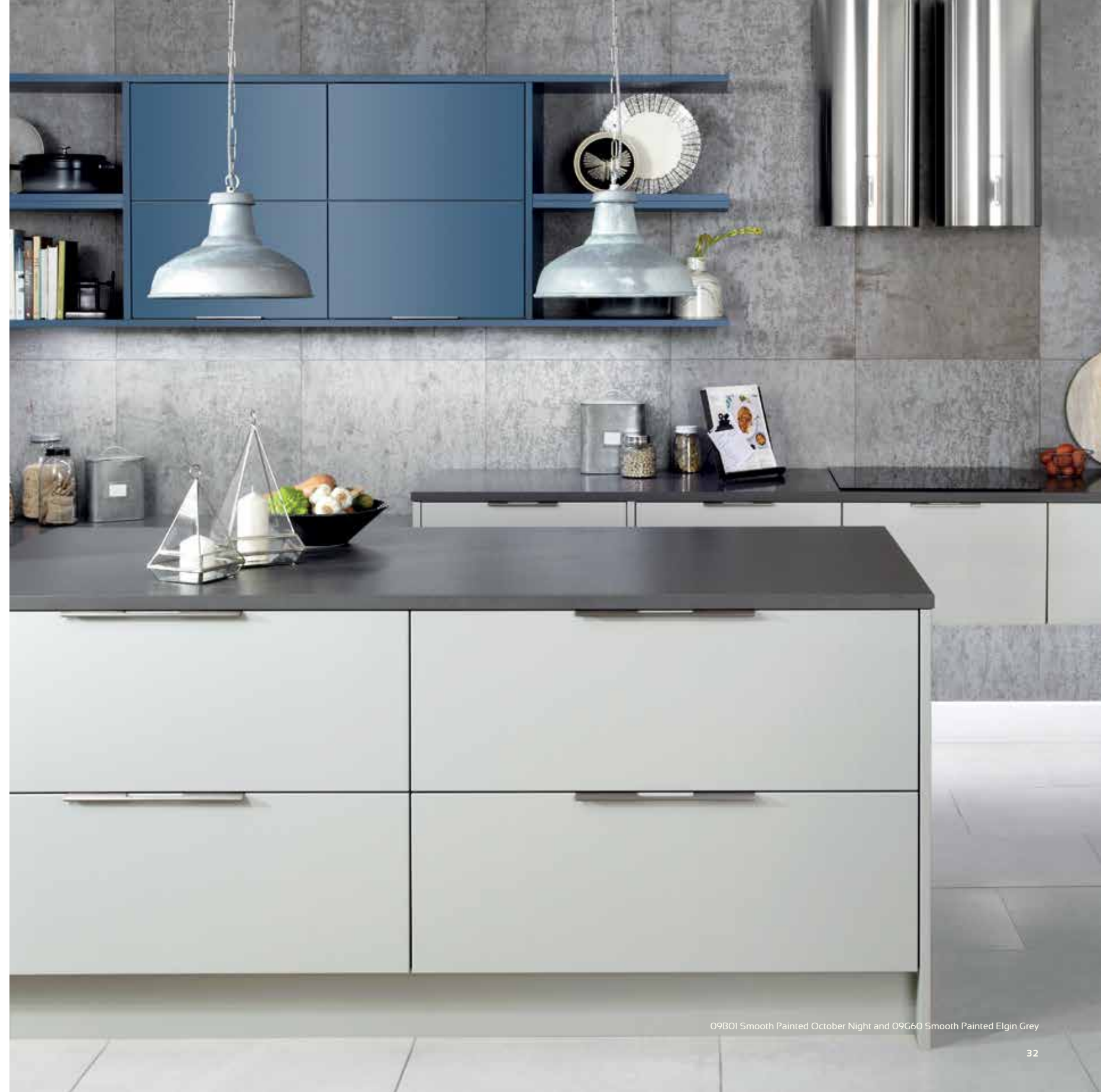
09B01 Smooth Painted October Night and 09C60 Smooth Painted Elgin Grey