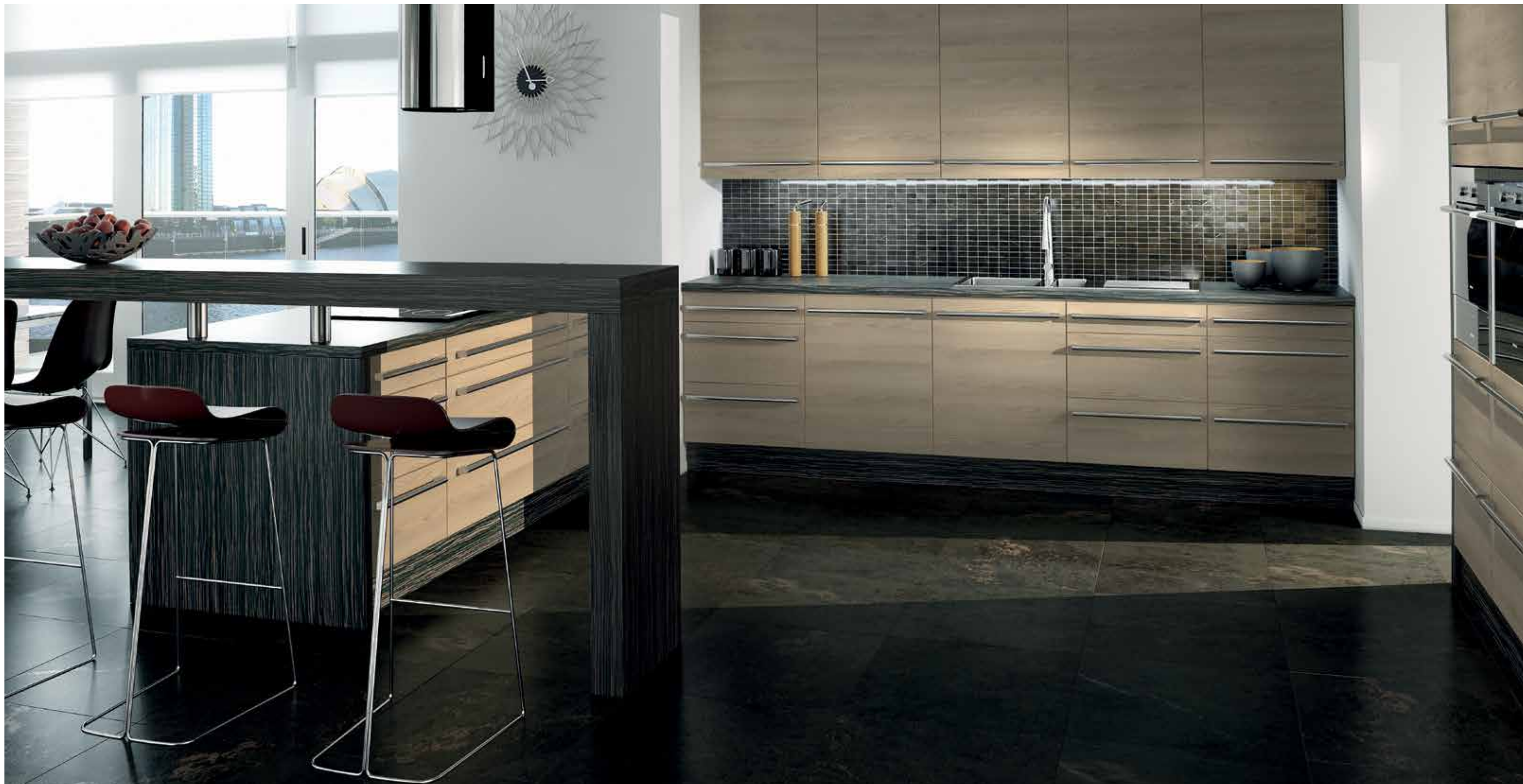
04E75HG Navarra Ash and 01440HG Amazonas