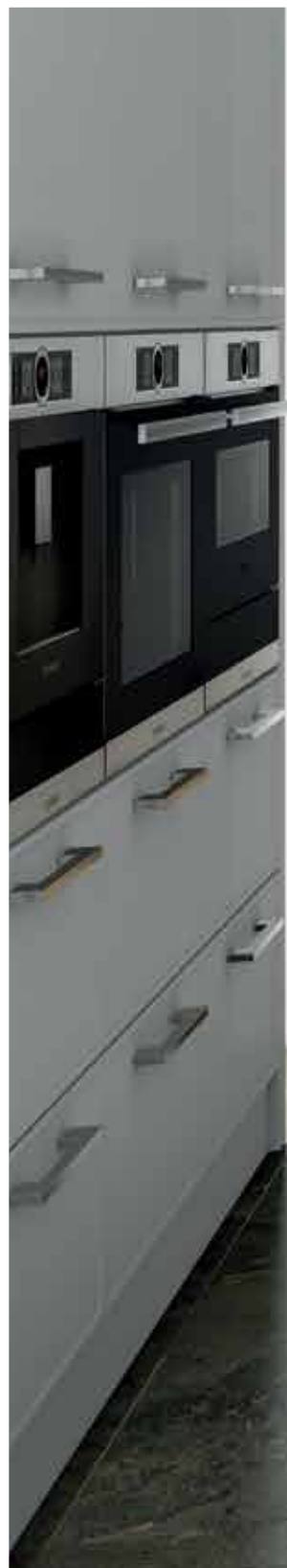
18553 Rio Painted Light Grey and 01614HG Caribbean Walnut