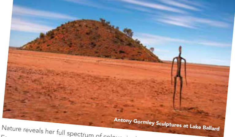
Antony Gormley Sculptures at Lake Ballard

Nature reveals her full spectrum of colours in the Golden Outback. Esperance, a laidback town boasting pristine coastal landscapes, including the famous Cape Le Grand National Park, is where you will find Australia's whitest sands. Head down to Lucky Bay to swim, sunbathe and snap a selfie with the resident kangaroo population! Nearby Lake Hillier is the brightest bubblegum-pink colour and one of the most extraordinary sights. The best way for travellers to see this spectacle is by scenic flight, providing an unbeatable view and even better Instagram post!