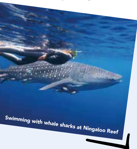
Swimming with whale sharks at Ningaloo Reef

You can also meet Monkey Mia's famous dolphins at another World Heritage listed area along this coastline, Shark Bay. The dolphins have been visiting the shoreline daily for over 40 years, making it one of the most reliable places for natural dolphin interaction in the world! The area is also home to the largest population of the mysterious dugongs. Further south, Geraldton is another must-visit destination for kite-surfing as well as snorkelling and diving around the stunning Abrolhos islands, while nearby Hutt Lagoon will astound with its bright pink waters.