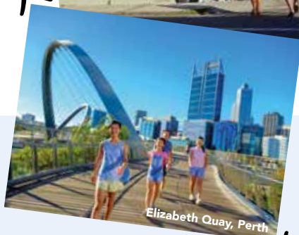
Elizabeth Quay, Perth

A year-round holiday destination, but the best time to take advantage of Perth's sunshine is October - May. Perth is at its liveliest between January and March when a series of art festivals take over the city's spaces.