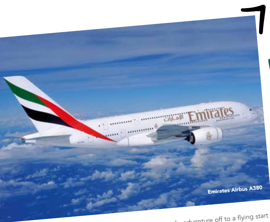
Emirates Airbus A380