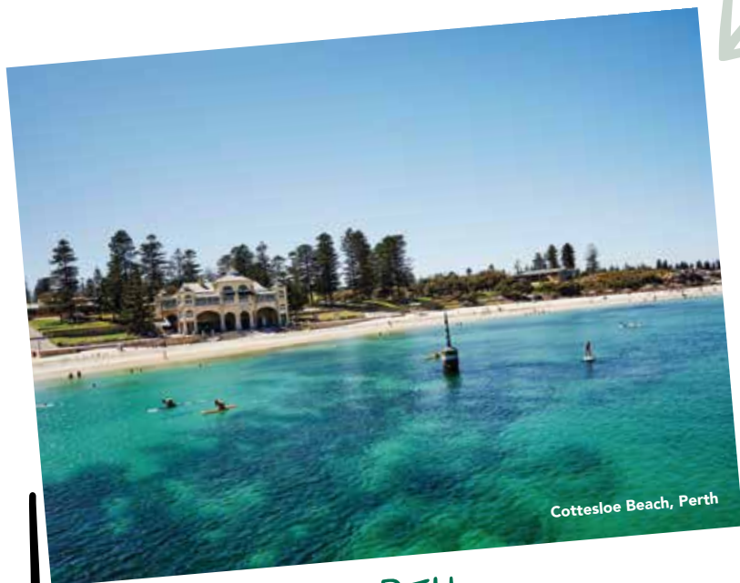
Cottesloe Beach, Perth