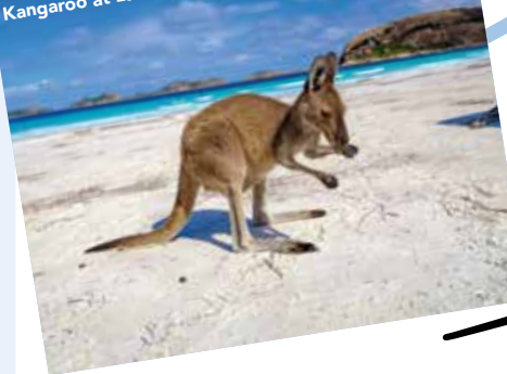
Kangaroo at Lucky Bay, Cape Le Grand National Park

Head inland to Kalgoorlie for the red hues of the outback and tales of gold. Home to the richest gold mine on the planet, the town and surrounding area are alive with a rich history. The best way to explore it is on a road trip to combine ghost towns, character-filled outback pubs and stunning outback artwork. The vast landscapes here inspired Sir Anthony Gormley to create an art installation of 51 figures spread across the shimmering salt flats of Lake Ballard. Further west, another work of art is waiting to be discovered, although this time created by Mother Nature herself. Wave Rock is one of Australia's biggest waves but is nowhere near the ocean. It is over 2,700 million years in the making, rises 15 metres over the outback and is the shape of a giant wave coming to crash over the surrounding outback.