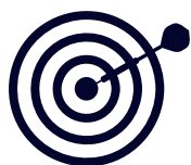
Focusing on your goals

Your approach to investment will vary depending on what you are looking to achieve.