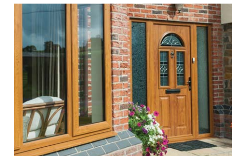
16 | FRONT & BACK DOORS