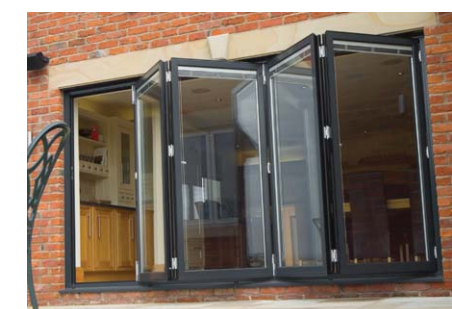
28 | BI-FOLDING DOORS