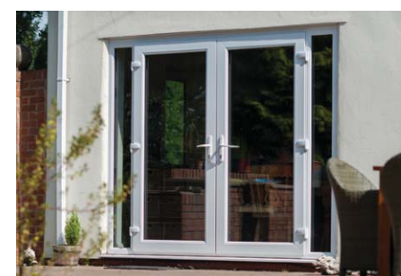
24 | FRENCH DOORS