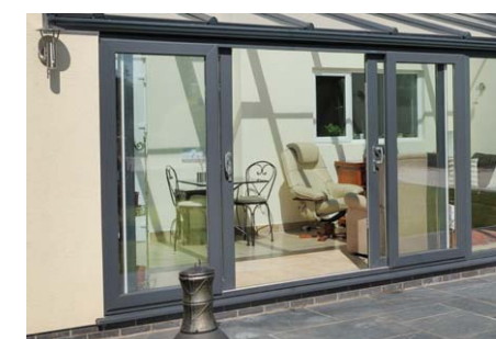
26 | PATIO DOORS