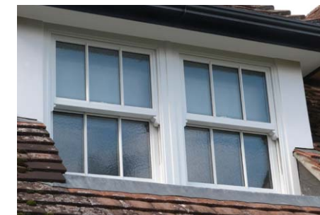
10 | SASH WINDOWS