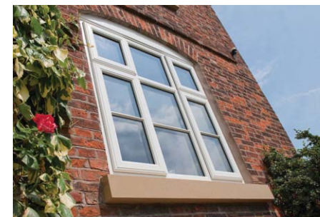
4 | CASEMENT WINDOWS