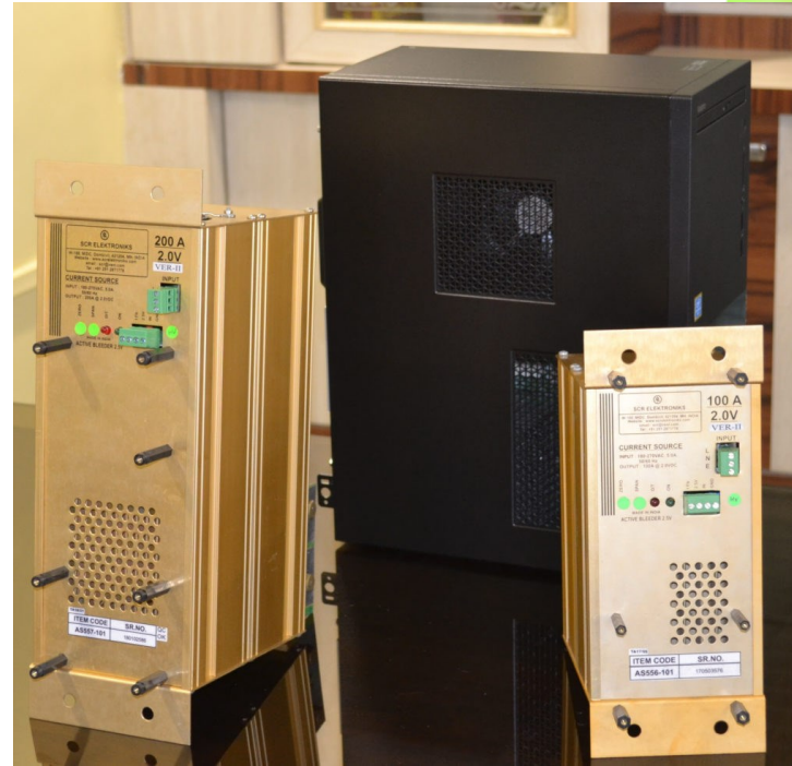
High Current Sources