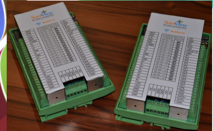
Data Acquisition Devices