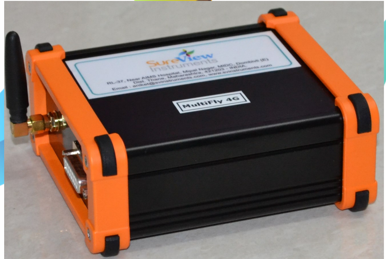
MultiFly series – MultiFly 4G