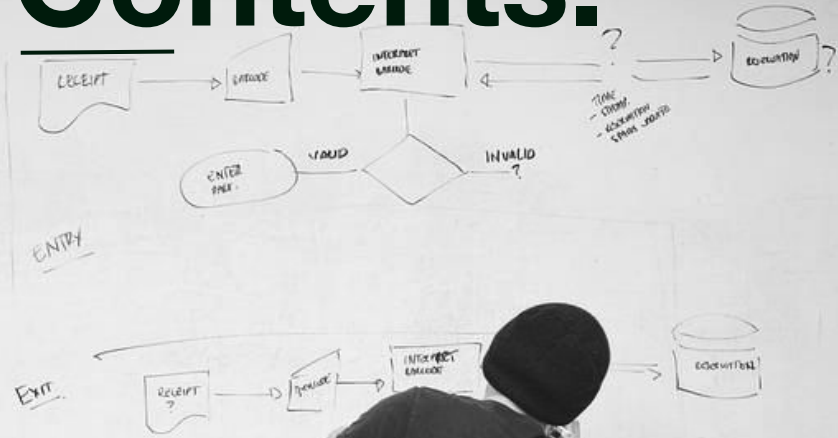
Sales funnel diagram sketch.