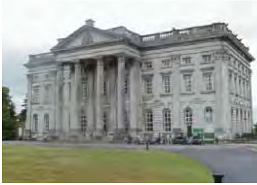
Moor Park Golf Club

“ We are looking forward to Whittle undertaking the exterior painting under our 10 year maintenance programme, which is a very cost-effective and efficient way of carrying out what is a hugely difficult task ”