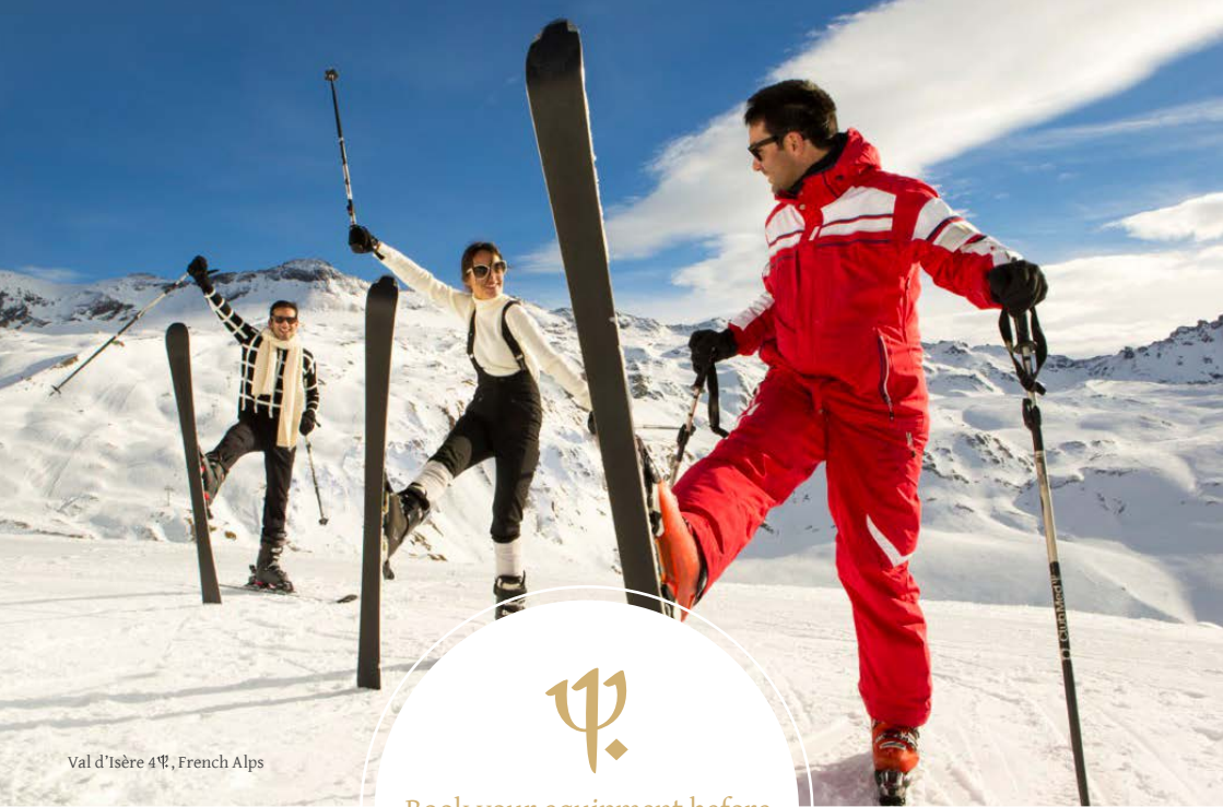
Val d'Isère 4Ψ, French Alps