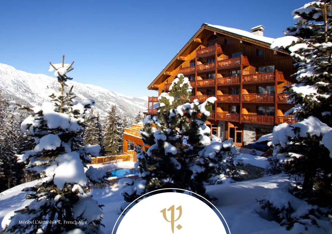
Méribel L'Antarès 4*, French Alps