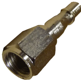
PCL Type Female Bay