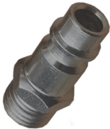
Hi Flow Male Bay