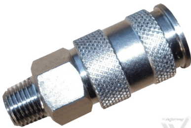
Hi Flow Male Body