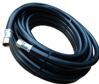
10 Metre Air Hose