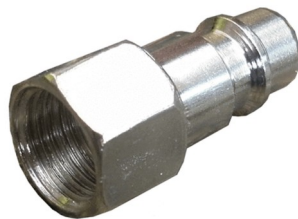
Hi Flow Female Bay