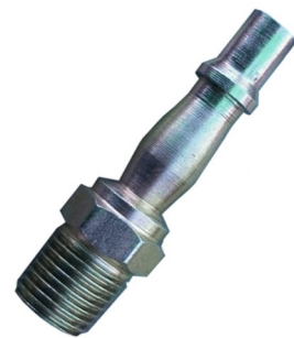
PCL Type Male Bay