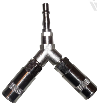
PCL Type "Y" Complete