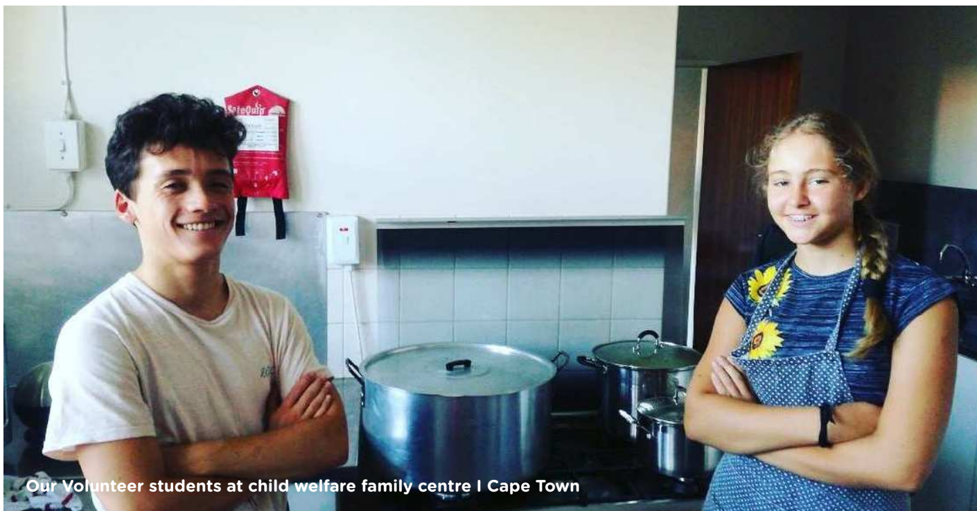
Our Volunteer students at child welfare family centre | Cape Town