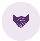
Wellness Check + Social Support

Regular calls to reduce isolation and loneliness