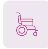
Mobility & Personal Care