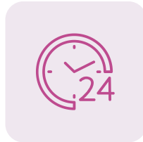
24/7 Live-In Care