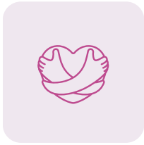
Companionship & Conversation

Our services are designed to give your loved one the support they need, while giving you peace of mind.