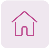
Post-Op Recovery at Home