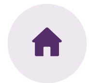
Stay at Home

Total weekly care package to support at home 24/7