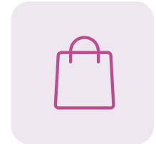
Shopping & Errands